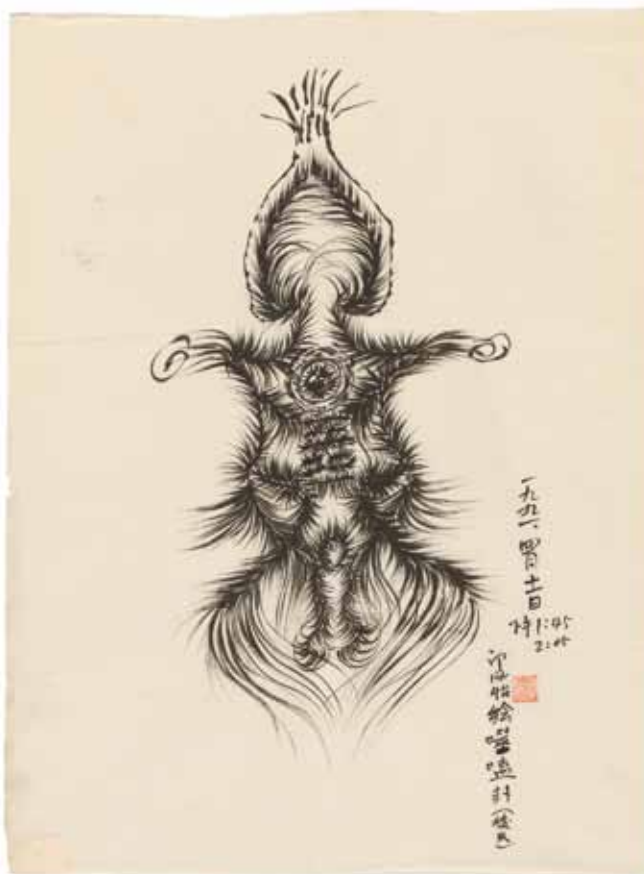
Guo Fengyi La divination de Shihe , 1991 Indian ink on paper 91 x 67,5 cm Collection de l'Art Brut, Lausanne.