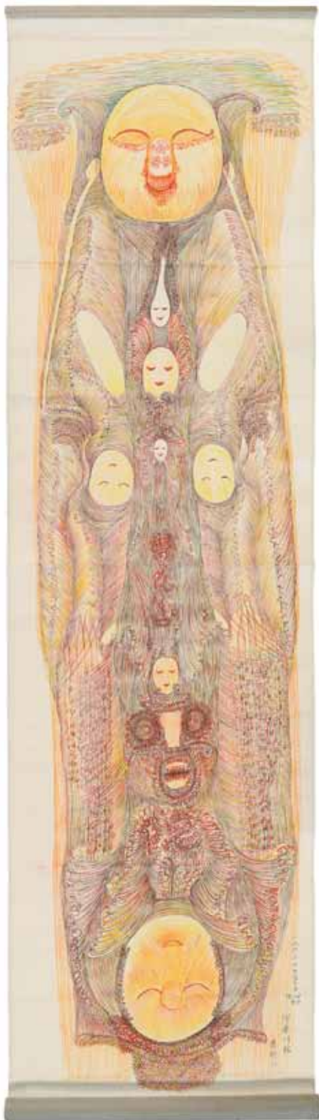
Guo Fengyi Le Mont Putuo , 1993 Ink on paper 153,5 x 52 cm Collection de l'Art Brut, Lausanne.

Available images can be found at our site www.artbrut.ch under «Médias > dossiers de presse». These images are available only to promote the Guo Fengyi exhibition. Mention of the image captions is mandatory.