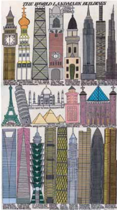
Gregory Blackstock The World Landmark Buildings , 2011 Lead pencil, felt-tip pen, wax oil crayon, and colored pencil 112 x 60,6 cm Gift of the artist and GardeRail Gallery. Collection de l'Art Brut, Lausanne.