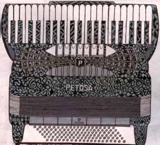
ARTIST MODEL'S CHARCOAL PEARL COLOR PATTERN 1200 OF THE MIDDLE 1950S, EXACT MEN'S-SIZE