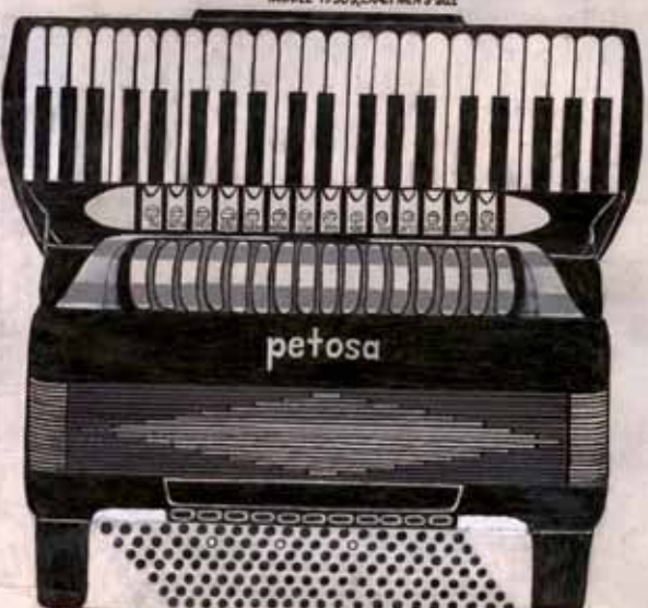
FANCY OBSOLETE AND/OR PROPOSED COMPLETE TONE-CHANGING TUNE CONCERT GRAND ARTIST MODEL OF THE AUGMENTED TRIAD CHORD-OPERATED 140-BASS KEYBOARD—AT THE CUSTOMER'S REQUEST AND DESIRE ONLY AS MANUFACTURED FOR HANDCRAFTED BY: Gregory J. Blackstock 2011

Gregory Blackstock, 60 Years of the Artist Model Petosa Accordions , 2011 Lead pencil, felt-tip pen and wax oil crayon, 124,2 x 79,1 cm Gift of the artist and GardeRail Gallery. Collection de l'Art Brut, Lausanne.