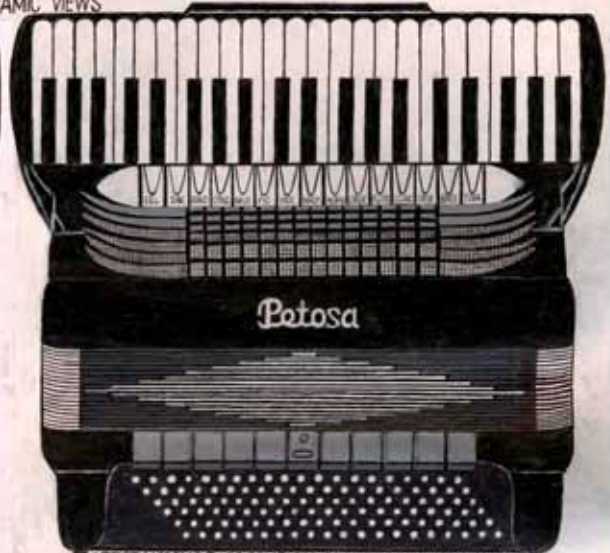
ARTIST MODEL'S RARE COMPLETE CONCERT GRAND 1100 ACCORDION DESIGN OF THE EARLY 1950S.