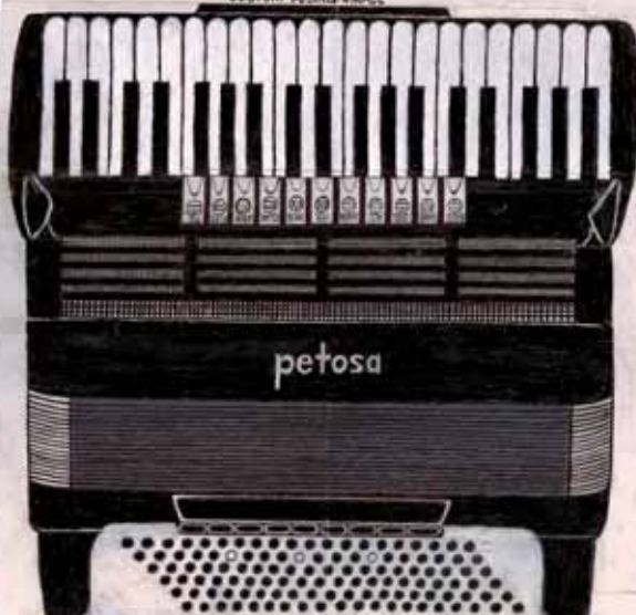
ALL-NEW MODERN ARTIST MODEL 1100—SEATTLE'S HIGHEST-QUALITY CONCERT GRAND ACCORDION DESIGN