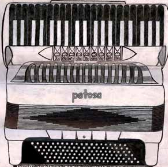
ARTIST MODEL'S BACKWARD COLOR PATTERN 1400 OF THE EARLY 1960S, CUSTOM-DESIGNED & MADE