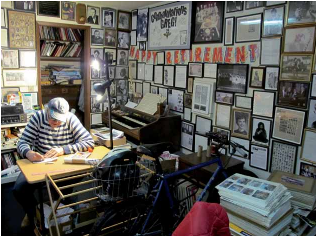
Seattle, 2010