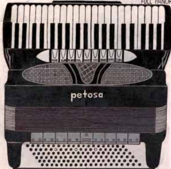
ARTIST MODEL'S 1956 FRENCH MUSETTE TONER 1200 ACCORDION DESIGN—CUSTOM DESIRED—4—PLANNED IN MANUFACTURING.